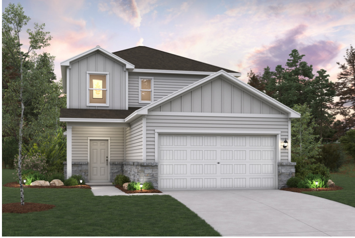
Elevation A1 Elevation B