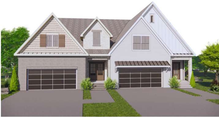
Windsor C | Tudor D

2,368 - 2,476 Sq.Ft. | 3 Bed | 3 Bath | 2-Bay Garage +Bonus Room