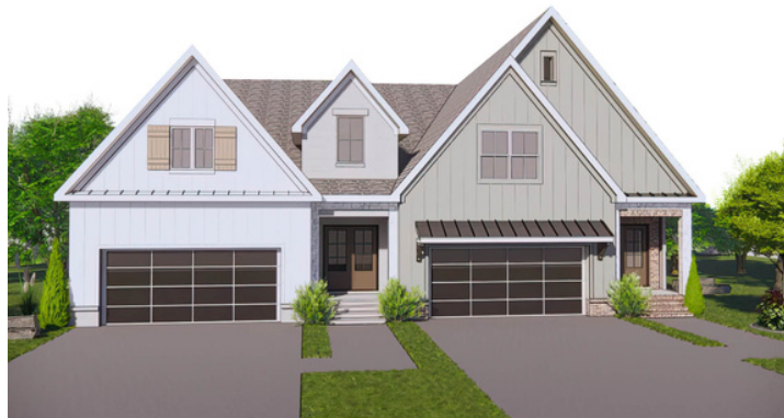
Windsor K | Tudor L

CenturyCommunities.com/ParkAtWiltshire | 615.234.6090